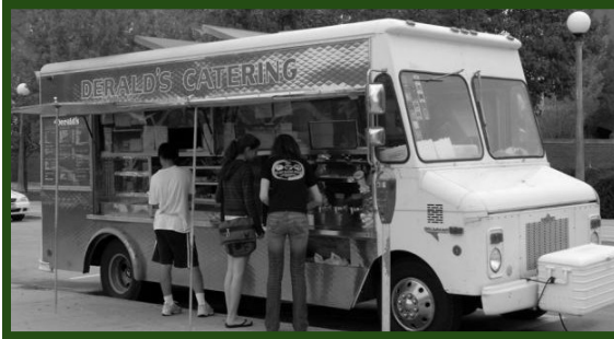
Example of a catering truck.

If you have any questions regarding this issue or would like to report a problem with vendor and peddlers or other code enforcement issue in your neighborhood, please call the City of Hawaiian Gardens Code Enforcement Division at (562) 420-2641 Ext. 221/224/277.