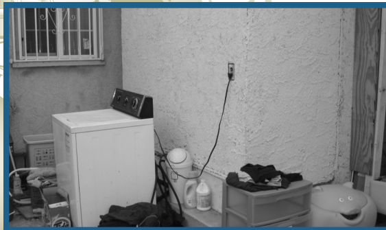
Appliances located outside a home

Permitted outdoor items include patio table and chairs, lawnmower, and barbeque grill. Furniture meant for indoor use, such as a couch or sofa, is prohibited from being placed outside in any yard, this prohibition extends to the front porch area.