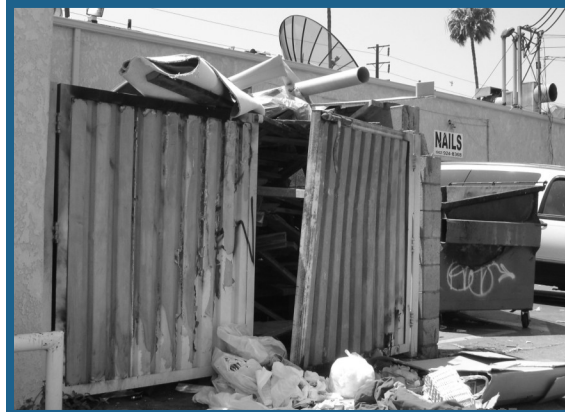
Example of trash and debris overflowing dumpster.

If you have any questions regarding this issue or would like to report a problem with trash and debris or other code enforcement issue in your neighborhood, please call the City of Hawaiian Gardens Code Enforcement Division at (562) 420-2641 Ext. 221/224/277.