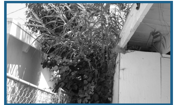
Overgrown weeds and plants

The maintenance of properties within the City is the responsibility of every property owner and occupant of a building, grounds, or lot. Yard maintenance includes the cutting down or mowing of areas on a regular basis to prevent overgrown plant materials. Dead trees and limbs must be removed and vegetation and trees trimmed so as to not impair vision or obstruct the travel of motorists.