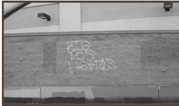
Example of graffiti on a wall.

If you have any questions regarding this issue or would like to report a problem with graffiti or other code enforcement issue in your neighborhood, please call the City of Hawaiian Gardens Code Enforcement Division at (562) 420-2641 Ext. 221/224/277.