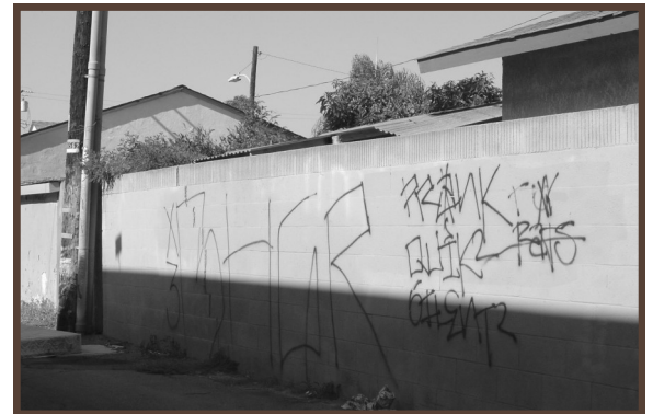
Example of Graffiti

When Code Enforcement locates graffiti, or witnesses an act of graffiti, they can initiate the Administrative Citation Process and require that the person(s) responsible clean up the site. The Administrative Citation Process includes, but is not limited to, warning notices and citations with increasing fees for each violation. Refer to the "Code Enforcement" brochure in this series for a complete discussion of the role of Code Enforcement and the Administrative Citation Process.