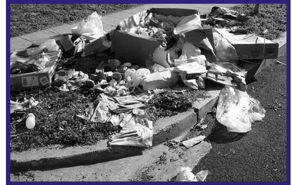
Example of an illegal dumping.

Illegal dumping is an issue that the City and Code Enforcement takes very seriously. It detracts from the visual appearance of the City and creates hazards to the health and safety of its residents. The Municipal Code states that no person shall place, deposit, throw or dump, any garbage, swill, cans, bottles, papers, ashes, dirt, sand, rock, cement, glass, metal, dead animal carcass, offal, refuse, plants, cuttings, trash or rubbish of any nature whatsoever, or any nauseous, offensive matter in or upon any public or private property, including alleys.