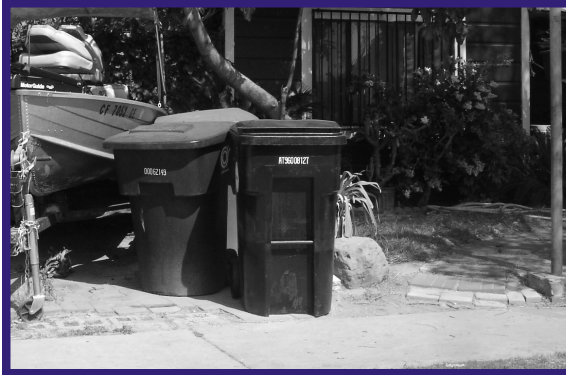
Example of trash cans left out.

If you have any questions regarding this issue or would like to report a problem with illegal dumping or bulky items in your neighborhood, or if you would like to report another code enforcement issue, please call the City of Hawaiian Gardens Code Enforcement Division at (562) 420-2641 Ext. 221/224/277.