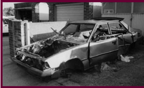
Example of an inoperable vehicle stored within public view.

If you have any questions regarding this issue or would like to report an abandoned vehicle or if you have another code enforcement issue in your neighborhood, please call the City of Hawaiian Gardens Code Enforcement Division at (562) 420-2641 Ext. 221/224/277.